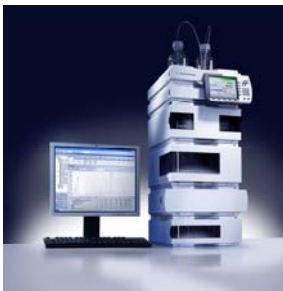
1200 Series LC

GC and LC are used to separate mixtures into their individual components. These techniques can often be used on their own to screen food products for prohibited compounds. The GC is the instrument of choice when the sample can be vaporized without too much difficulty. LC is useful for separating nonvolatile and thermally fragile molecules. For more complex mixtures or when more information is required, a GC or LC is often used in conjunction with an MS. The latter is particularly useful in identifying unknown compounds and determining the amount of each substance encountered.