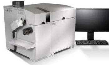
7700 ICP- MS